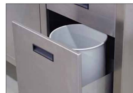
Disposal unit including waste container