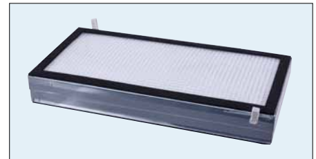
Activated carbon gas filter