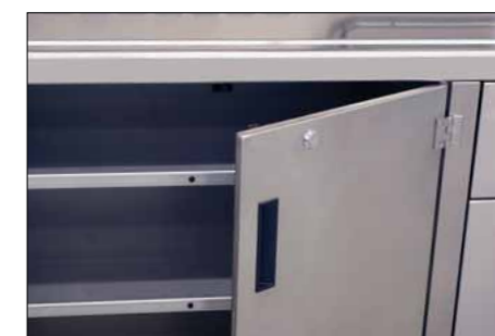
Drawer and lockable double door, table top with drain channel