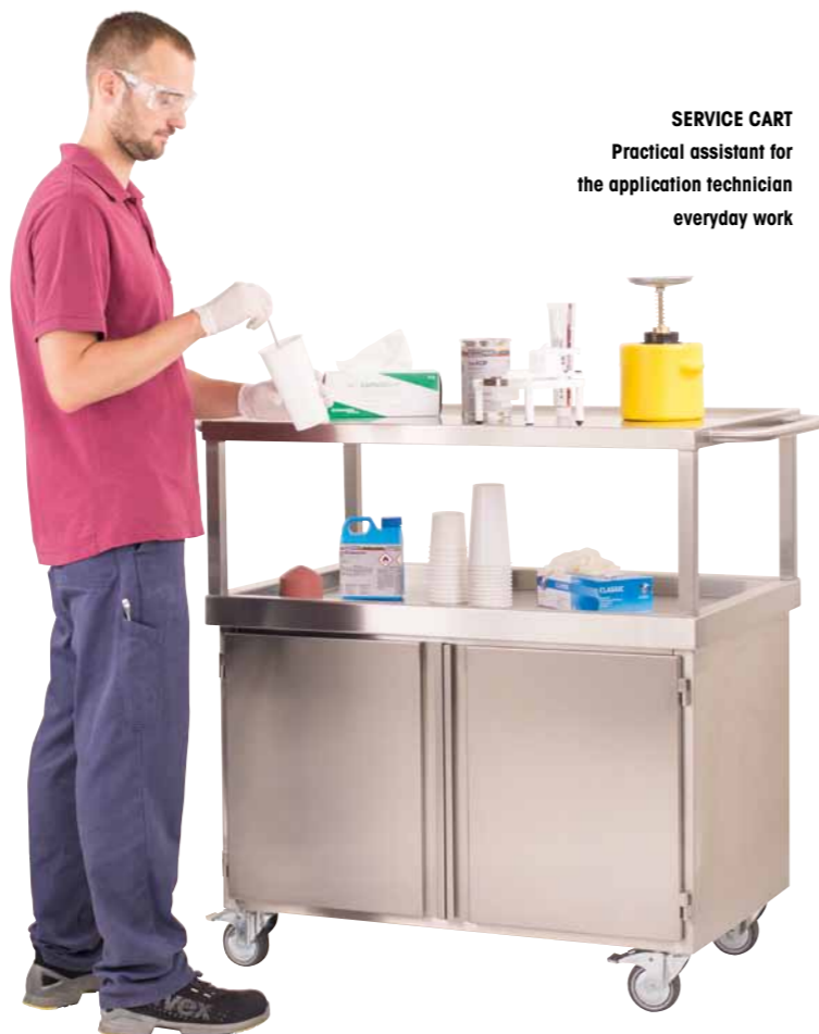
SERVICE CART Practical assistant for the application technician everyday work