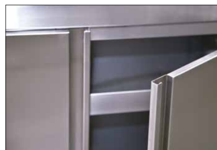
Hinged wing doors with recessed handles