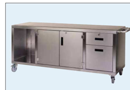
Mobile base cart