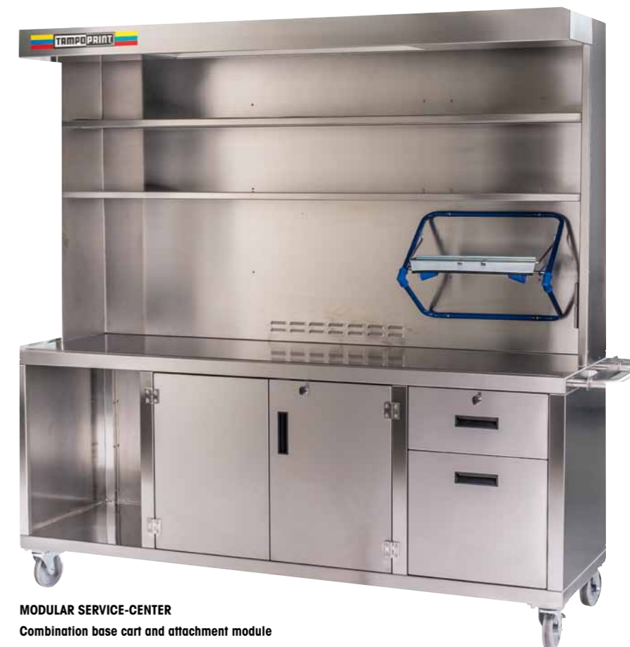
MODULAR SERVICE-CENTER Combination base cart and attachment module