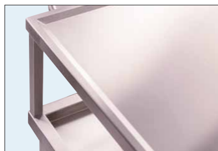
Protective drain edges