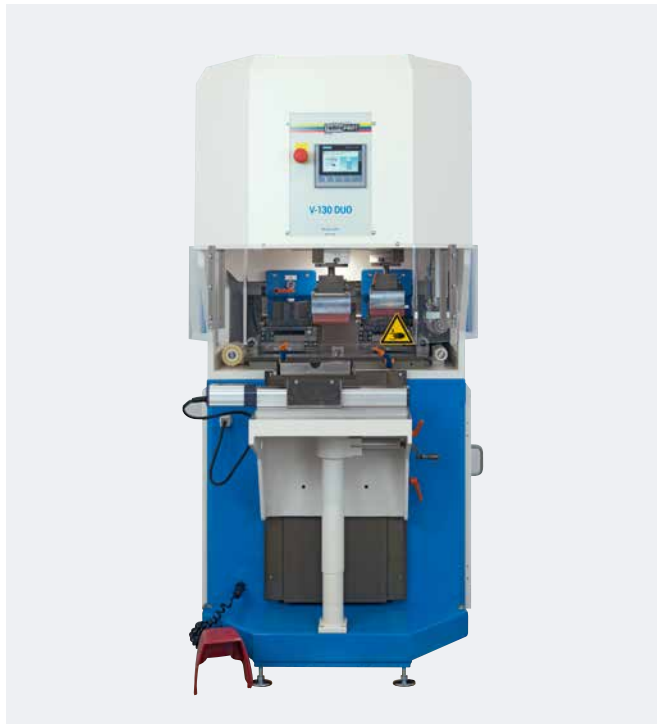
V-DUO 130/130 Connector block