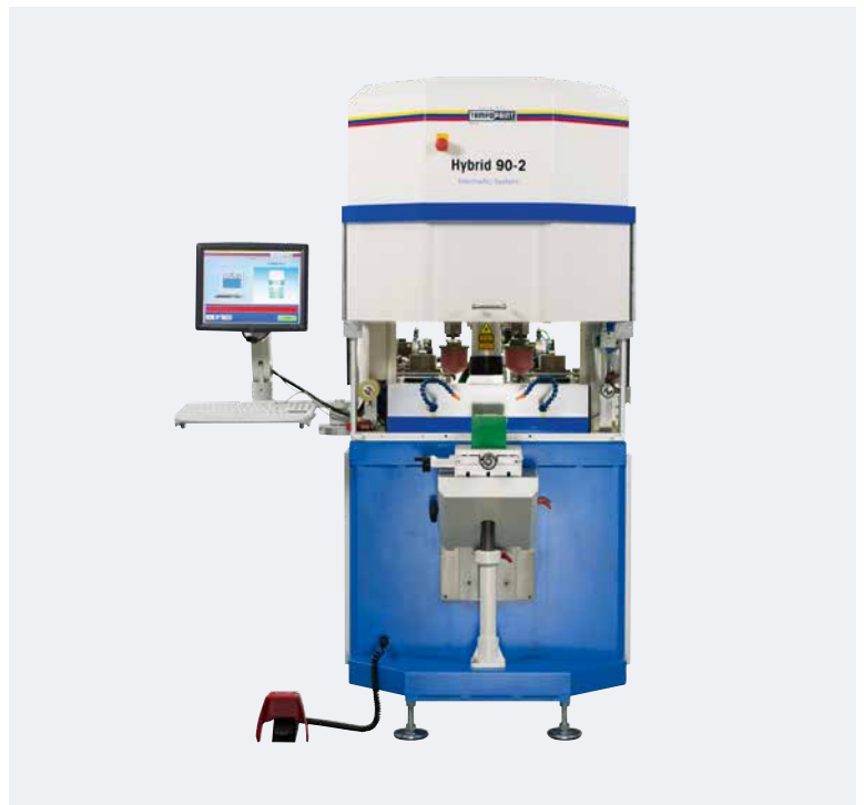
HYBRID 90-2 2-color pad printing machine with integrated cliché production