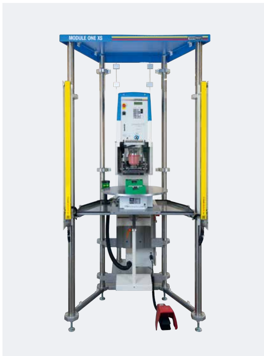
MODULE ONE XS Manual workstation with rotary index table and light curtain

Machinery construction "Made in Germany", supported by highly qualified staffs in the sales department, project management, engineering department as well as pre- and aftersales service will guarantee the professional realisation from the concept to the 24 hour production to our customers.