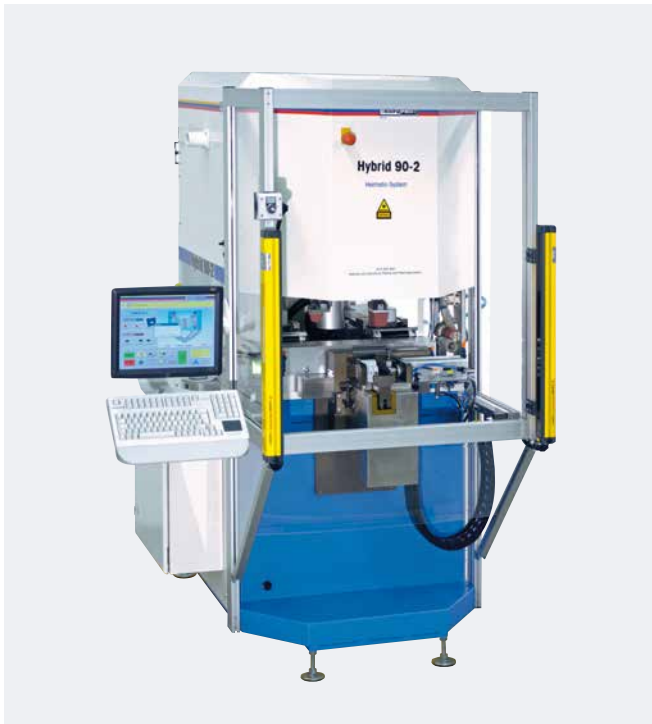
HYBRID 90-2 with option light curtain Circuit breaker