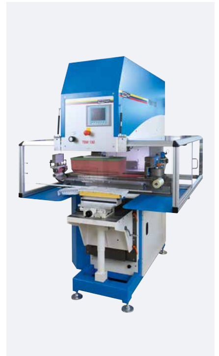
TSM 130 universal transverse doctor kit