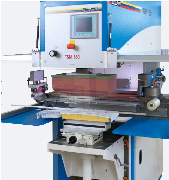
TSM 130 universal transverse doctor kit with ink residue pick-up system (option)