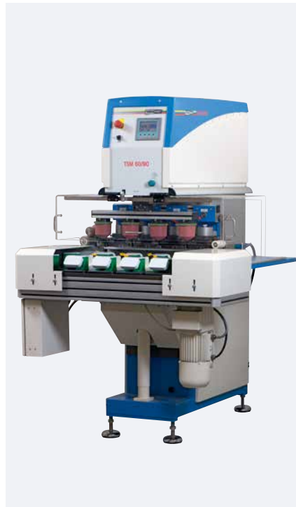
TSM 60/90 universal multiple color kit Solo