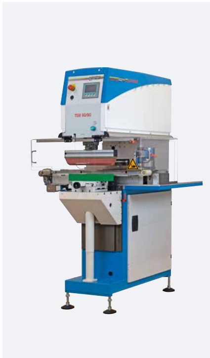
TSM 60/90 universal transverse doctor kit

Versions with servomechanical drive are characterized by a very high number of cycles and a very high force of pressure. Energy-efficient cinematics in doctor or pad movement and a resource-saving machine frame construction round off the successful machine concept.