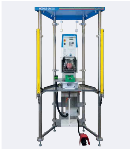
MODULE ONE XS with pad printing machine HERMETIC 9-12-universal

The MODULE ONE XS consists basically of a compact frame, a safety enclosure as well as the four standardized components: Rotary index table, light curtain, angle table and cross slide. The pad printing machine will be individually selected from the machine series HERMETIC, SEALED INK CUP E and V-DUO.