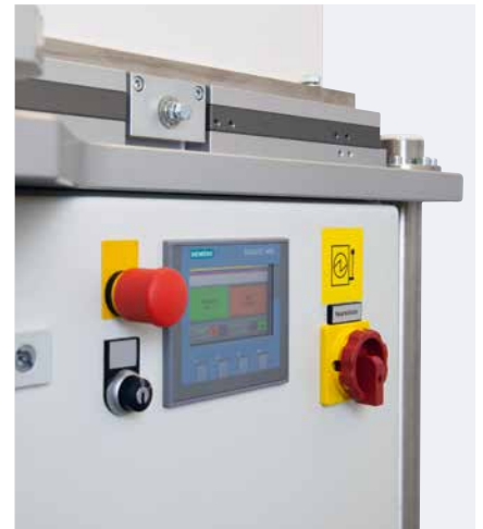
Touch panel for the operation of the index table

The height adjustable angle table with the useful storage area allows the printing of