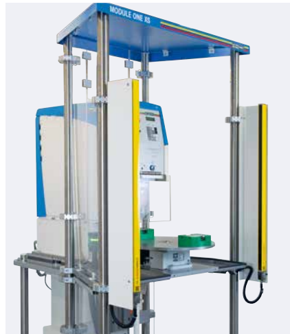
Light curtain, rotary index table, angle table

The MODULE ONE XS consists basically of a compact frame, a safety enclosure as well as the four standardized components: Rotary index table, light curtain, angle table and cross slide. The pad printing machine will be individually selected from the machine series HERMETIC, SEALED INK CUP E and V-DUO.