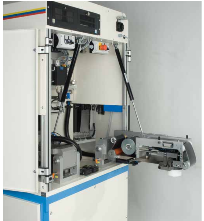
HYBRID-90-2 Slewable printing unit