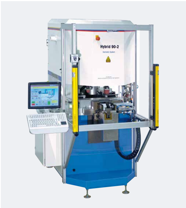
HYBRID 90-2 with option light curtain