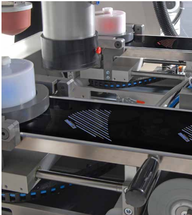
HYBRID-90-2 Integrated laser unit for production of printing clichés