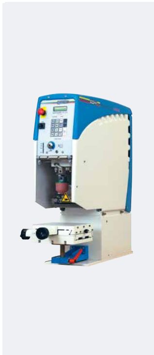
HERMETIC 6-12 universal

In addition to all the above advantages, the HERMETIC 150 offers a max. print image size of \varnothing 140 mm. An (optional) ink residue pick-up system can be fitted either on the right or left of the machine.