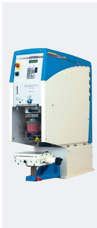
HERMETIC 9-12 universal