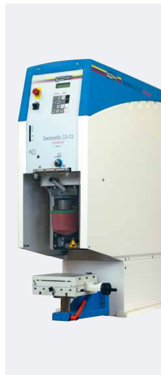
HERMETIC 13-12 universal