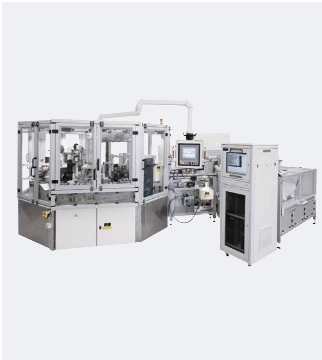
Automation Rotary pad printing Insulin pens

Machinery construction "Made in Germany", supported by highly qualified staffs in the sales department, project management, engineering department as well as pre- and after-sales service will guarantee the professional realisation from the concept to the 24 hour production to our customers.