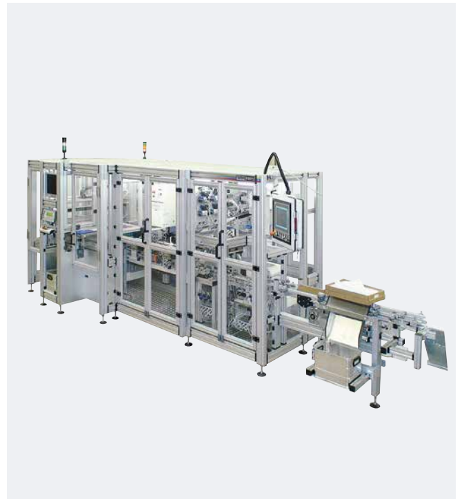
Automation for ampoule strips with RAPID 2000/130