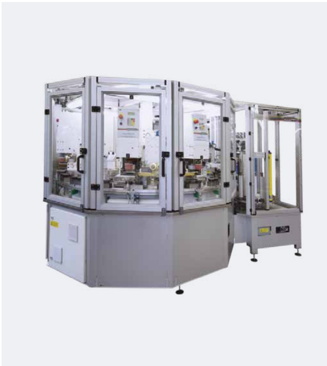
Automation for inhaler counter rings with RAPID 2000/90