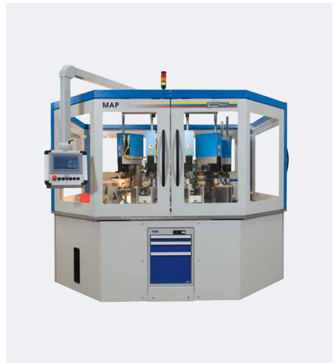
Automation MAP Ampoule strips