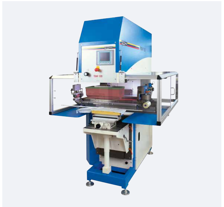
TSM 130 universal transverse doctor kit