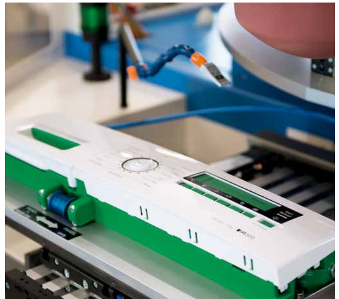
CONCENTRA 210-4 Jig with washing machine panel