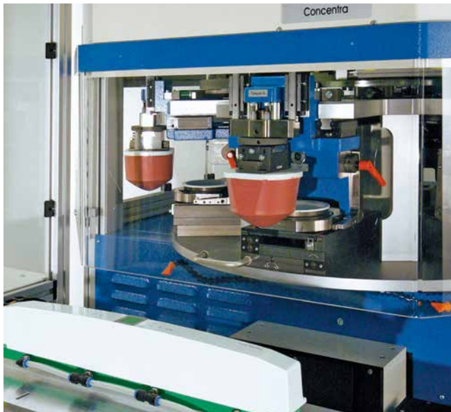
CONCENTRA 140-6 Jig with front cover