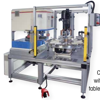
Reference CONCENTRA 90-4 with rotary indexing table and light curtain Brake discs