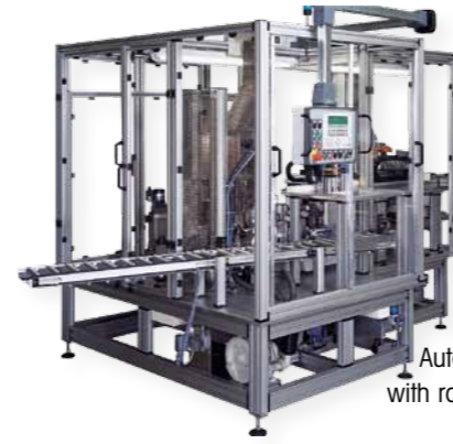
Reference Automated system RTI with rotary indexing table Spark plugs