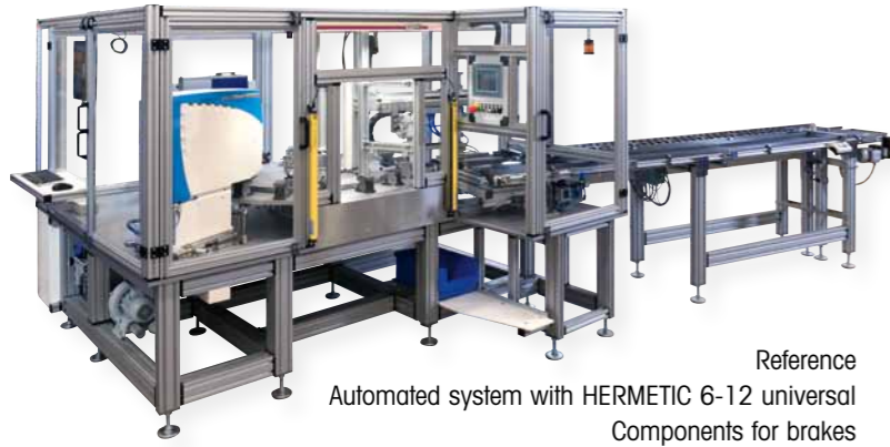
Reference Automated system with HERMETIC 6-12 universal Components for brakes