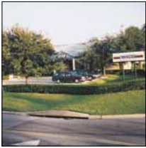
TAMPOPRINT® International Corporation, USA subsidiary since 1994 www.tampoprint.com