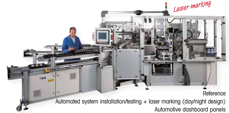
Reference Automated system installation/testing + laser marking (day/night design) Automotive dashboard panels