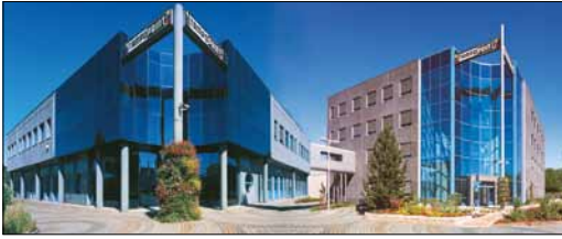
TAMPOPRINT Special machine construction since 1978