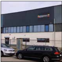
TAMPOPRINT® IBERIA S.A.U., Spain subsidiary since 2000 www.tampoprint.es