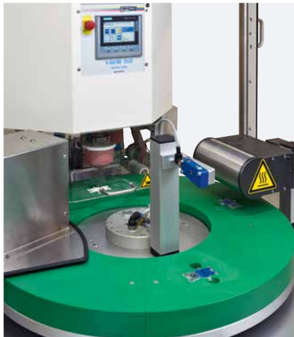
Multifunction jig surrounded by pad printing machine and components

The semi-automation MODULE ONE S is used for simple applications in pad printing. The part to be printed is manually inserted and removed.