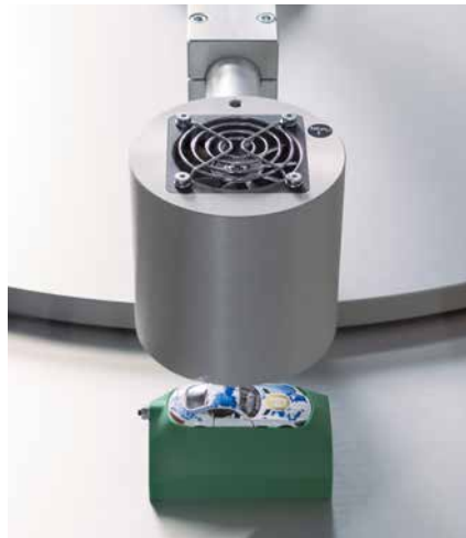
Component cold air drying – light surface drying of the pad printing ink for faster continuous printing

Central element of the MODULE ONE M is formed on a base frame, which can be flexibly assembled. The MODULE ONE M can be equipped with up to three machine satellites. For the assembly pad printing machines can be selected from the Series HERMETIC and SEALED INK CUP E. There are further positions available which can be additionally assembled: for instance, cold air drying, infrared-drying, part-recognition and laser component.