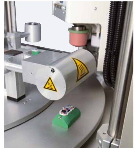
Component infrared-drying – shortens the drying time of the pad printing ink

Engineering and assembly are reduced through standardization of all auxiliary components. Solely the order-specific fixtures will be manufactured with modern machine tools.