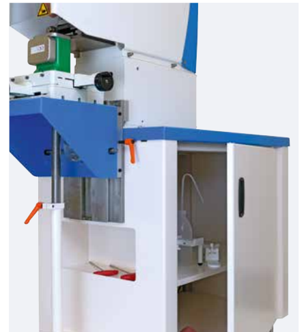
Useful shelf for tools and storage space

An angle table can optionally be mounted at the frame, enabling printing of different product sizes. In addition, cross slide or profile plates can also be installed, so that the pad printing machine can be used for multiple purposes.