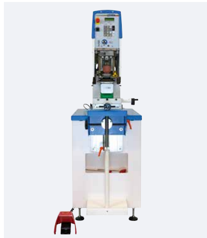
Pad printing machine with base frame

Thanks to the integrated cable routing, cables and hoses can properly and orderly be laid. Even the footswitch cable is placed in this safe space, contributing safety at work.