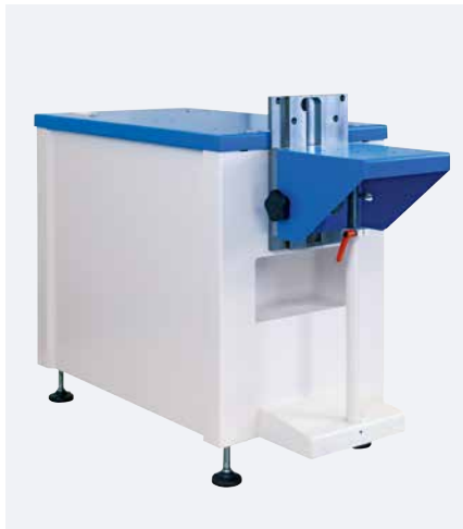
Machine base frame with optional angle table

The machine base frame can be universally used for the pad printing machines SEALED INK CUP E and HERMETIC, offering a sturdy and stable stand during the printing process.