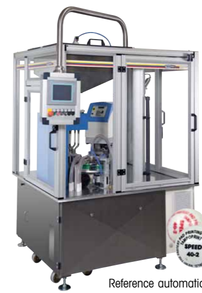
Reference automation for small parts with rotary index table