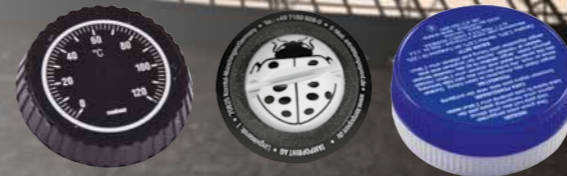
... proven SPEED change system