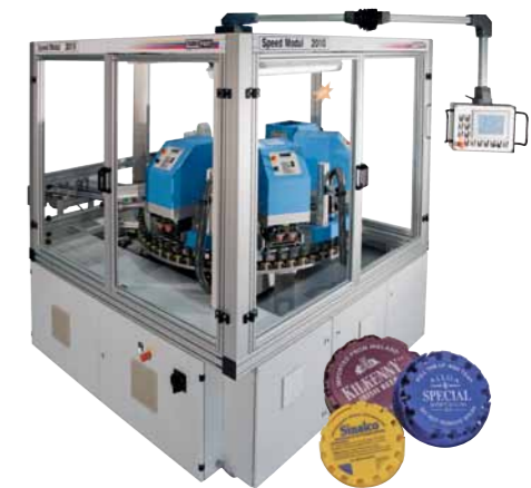
SPEED MODUL 2010 standardised automation assembly with high- speed NC index table