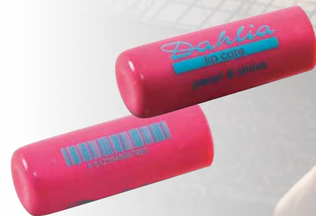
SPEED at the ring ...