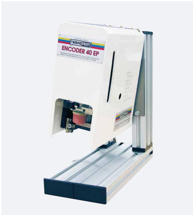
ENCODER 40 EP

For the EP series we offer our well-tried ink residue pick-up system. It can be optionally attached to the left or right (option).