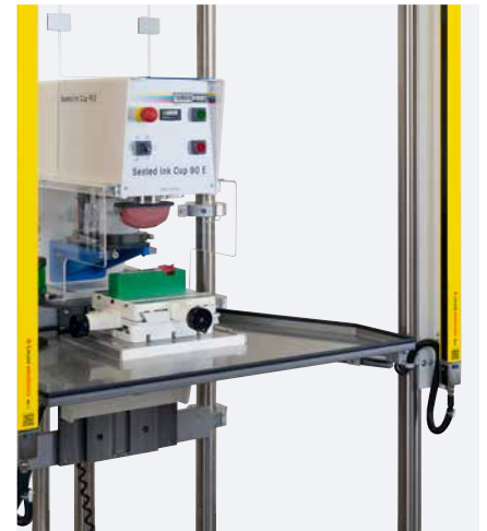
Angle table with storage shelf

A continuously height adjustable angle table allows the printing of parts with different heights .