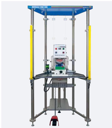
MODULE ONE XXS with pad printing machine SEALED INK CUP 90 E

The MODULE ONE XS consists basically of a compact frame, a safety enclosure as well as the three standardized components: Light curtain, angle table and cross slide. The pad printing machine will be individually selected from the machine series HERMETIC, SEALED INK CUP E and V-DUO.