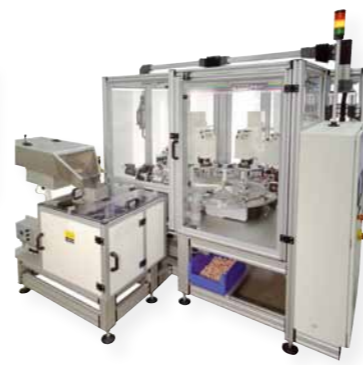
2 colour automation