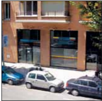
TAMPOPRINT® IBERIA S.A.U., Spain subsidiary since 2000 www.tampoprint.es