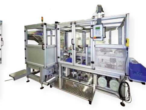
Automation with robot feeding