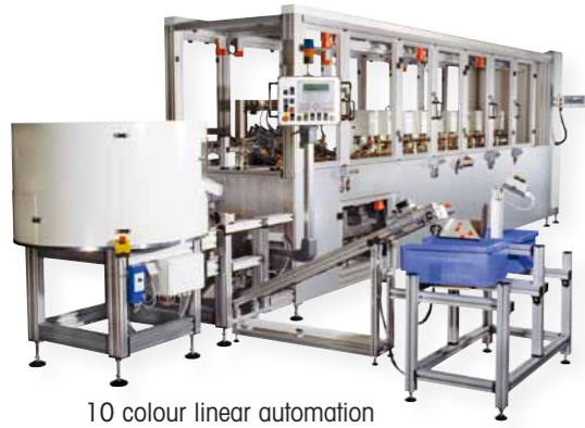
10 colour linear automation

We are your reliable partner for all industrial marking and decorating requirements