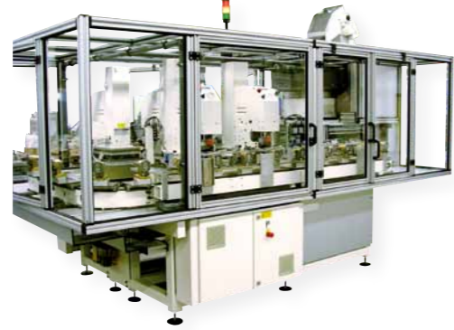
4 colour automation with feeding