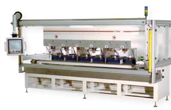
Linear automation with highspeed servo axis