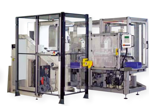
Automation with robot feeding