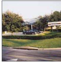
TAMPOPRINT® International Corporation, USA subsidiary since 1994 www.tampoprint.com