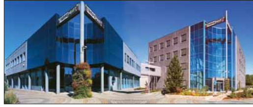
TAMPOPRINT® Special machine construction since 1978