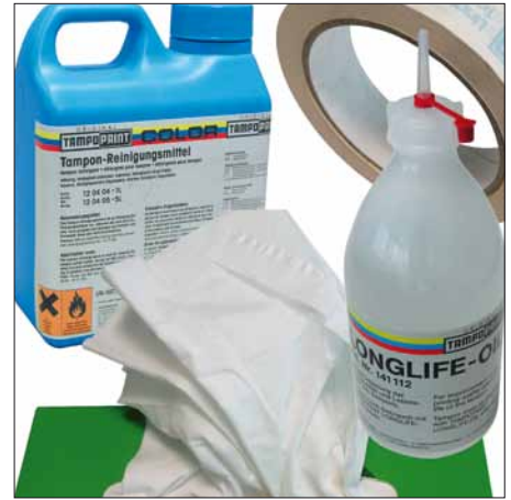
Picture: Consumables for the care of your tampons